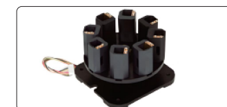
auto 8-cell holder (optional)