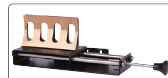
manual 4-position film holder (optional)